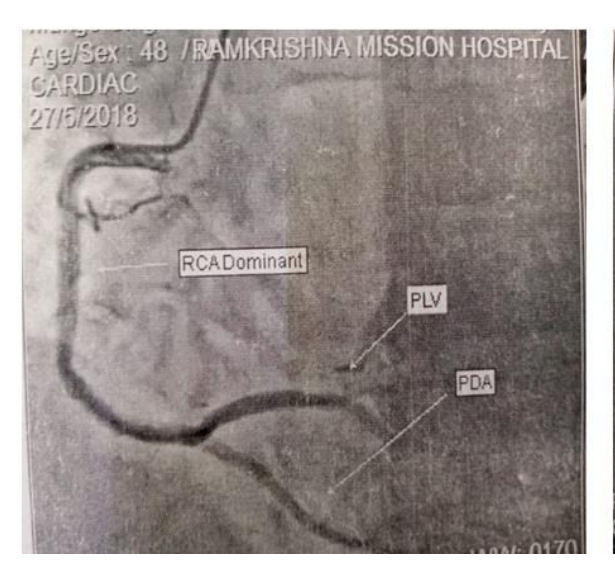
Figure 2: image showing right and left dominance